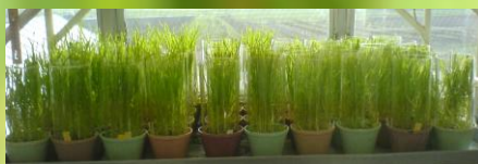
Figure 1: Inoculated plants in the greenhouse