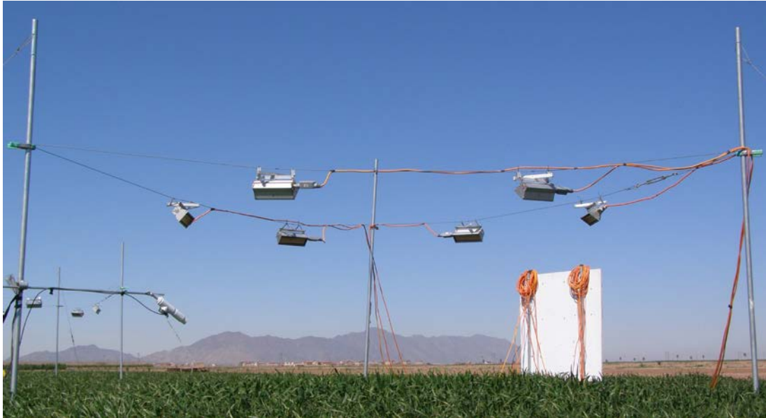
Figure 1. Photograph of the infrared heater system. In the centre foreground, infrared heaters are arranged in a circle above a wheat crop (Heated plot), and in the background to the left, the dummy non-operable heaters are arranged in a similar configuration (Reference plots).

The crops were irrigated at 100% replacement of potential evapotranspiration to maintain the soil water content at field capacity. Depending on planting date, the total amount of irrigation ranged from 362 to 921 mm. Water was supplied through a surface drip tape irrigation system with drip tapes placed 38 cm between every other row. Heated plots received 8% to 10% more water as a separate supplemental irrigation (except for the first planting on 13 March 2007) to provide a first-order correction for the increased plant-to-air vapor pressure gradient (Kimball, 2005). To guarantee good germination and emergence of the summer planted crops, additional sprinkler irrigation was provided. Soil fertility was managed to avoid nutrient limitations. Fifty to 56 kg N ha -1 and 67 kg P 2 O 5 ha -1 were applied as granular ammonium phosphate at planting, and urea ammonium nitrate was subsequently applied in irrigation water at rates of approximately 50 kg N ha -1 per application with up to four applications (at tillering, heading, anthesis and during grain filling) depending on crop requirements.